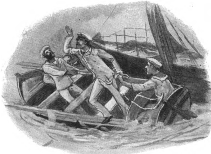
"HE PLUNGED AT ONCE INTO THE WATER."

"He says I murdered 'im," he protested. "It is simply absurd. Someone 'ad to go aboard. Are we to run away from these confounded ants whenever they show up?"