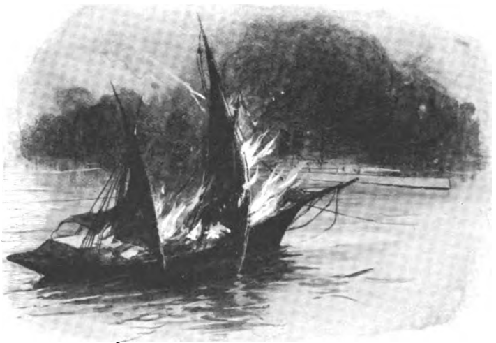
"THE CUBERTA WAS CRACKLING AND FLARING MERRILY."

The whole thing impressed him as incredibly foolish and wrong, but—what was