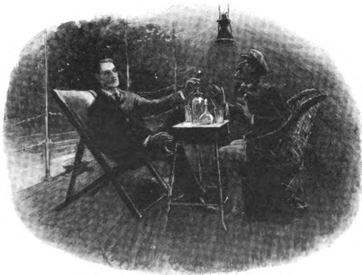
"HOLROYD AND GERILLEAU SAT LATE, SMOKING."

It was the inhuman immensity of this land that astonished and oppressed him. He knew the skies were empty of men, the stars were specks in an incredible vastness of space; he knew the ocean was enormous and untamable, but in England he had come to think of the land as man's. In England it is indeed man's; the wild things live by sufferance, grow on lease; everywhere the roads, the fences, and absolute security runs. In an atlas too, the land is man's, and all coloured to show his claim to it—in vivid contrast to the universal independent blueness of the sea. He had taken it for granted that a day