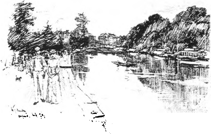
"THE TOW-PATH ALONG BY THE RIVER."

"Ah! you evidently don't know the man, or you wouldn't ask. There's something damnable about him, something reptilian. My gorge always rises at him. I should put him down as a man with secret vices—an evil liver. He's no fool, though. They say that he is one of the