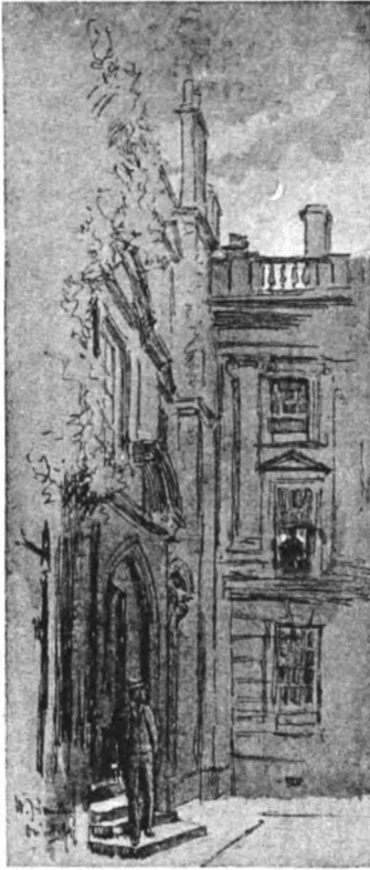
"HE SAW HIS NEIGHBOR'S HEAD AT THE WINDOW OUTLINED AGAINST THE LAMP-LIGHT."

single soul upon his way. He walked briskly along until he came to the avenue gate, which opened into the long gravel drive leading up to Farlingford. In front of him he could see the cozy red light of the windows glimmering through the foliage. He stood with his hand upon the iron latch of the swinging gate, and he glanced back at the road along which he had come. Something was coming swiftly down it.