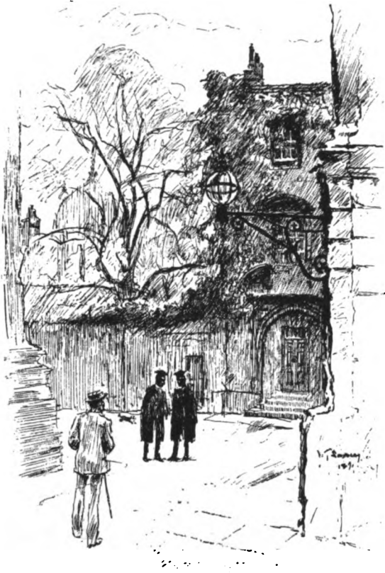
THE CORNER TURRET.

heavy arch which spans the open door has bent downwards in the centre under the weight of its years, and the gray lichen-blotched blocks of stone are bound and knitted together with withes and strands of ivy, as though the old mother had set herself to brace them up against wind and weather. From the door a stone stair curves upward spirally, passing two landings, and terminating in a third one, its steps all shapeless and hollowed by the tread of so many generations of the seekers after knowledge. Life has flowed like water down this winding stair, and, waterlike, has left these smooth-worn grooves behind it. From the long-gowned pedantic scholars of Plantagenet days down to the young bloods of a later age, how full and strong had been that tide of young English life! And what was left now of all those hopes, those strivings, those fiery energies, save here and there in some old-world church-